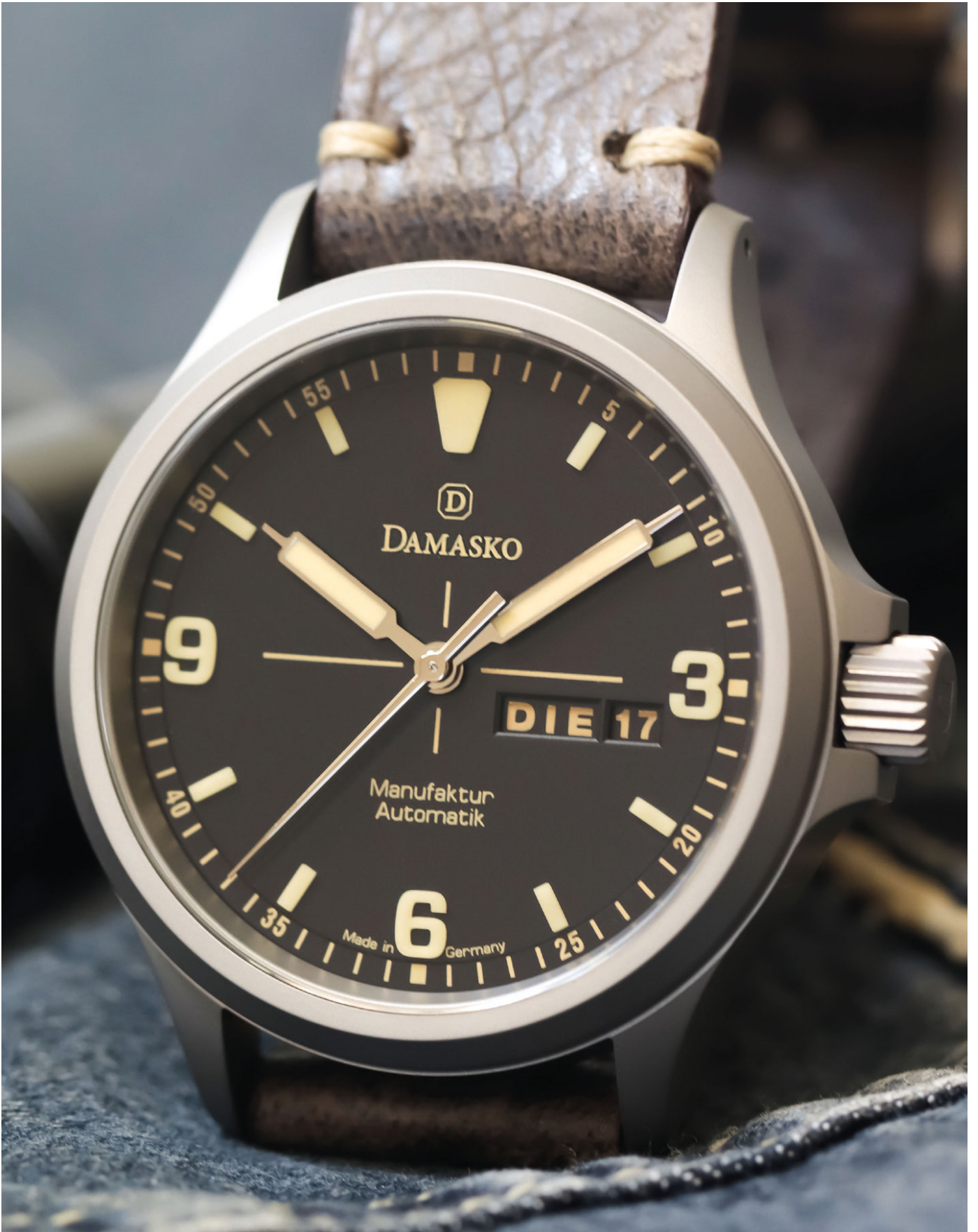
DK36/2 Old Radium