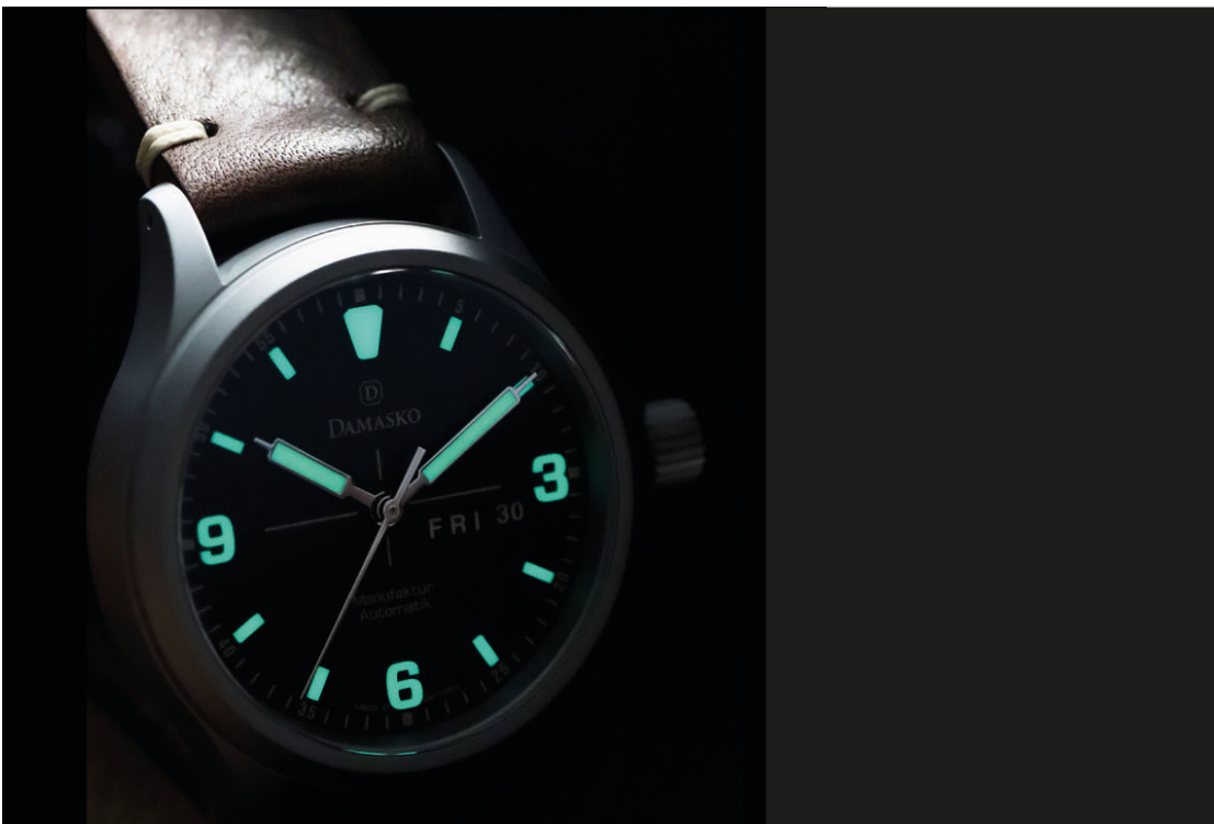
DK36/2 Night view